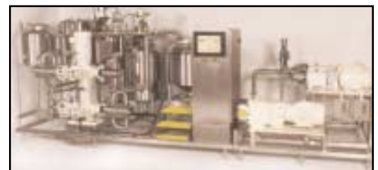
MAYO/SALAD DRESSING PROCESSING