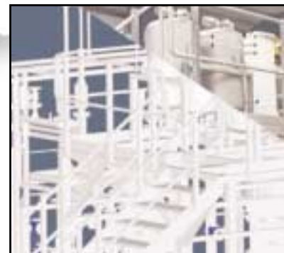
PROCESS SYSTEM DESIGN