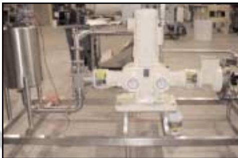
SHAVING GEL HYDROCARBON BLENDING

ing and Mixing Equipment Development Expertise nd Aftersales Support - Worldwide