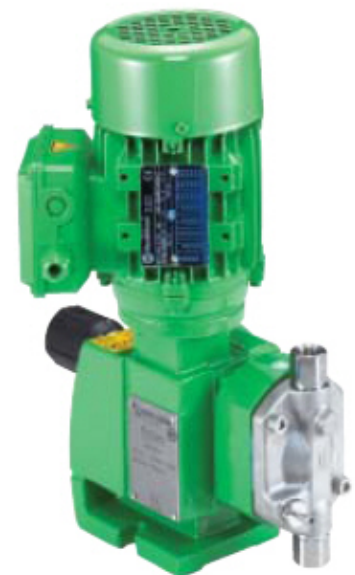
ProCam Smart DS 50

1-Pump Head / 2-Diaphragm Condition Monitoring / 3- Pump Yoke / 4- Gear Box / 5-Vernier Scale Stroke Adjuster / 6- Cover / 7-Motor / 8-Motor Adaptor Flange