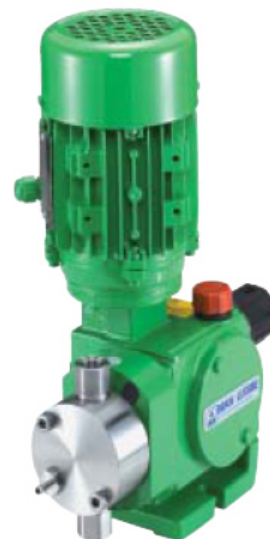
ProCam Smart DS 15

1-Pump Head / 2-Diaphragm Condition Monitoring / 3- Pump Yoke / 4- Gear Box / 5-Vernier Scale Stroke Adjuster / 6- Cover / 7-Motor / 8-Motor Adaptor Flange